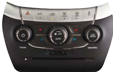
Climate Control Knobs