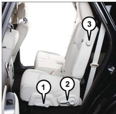
Rear Seat Lever Locations

To allow passengers to easily enter or exit the third-row passenger seats move the Tip 'n Slide control lever on the upper outboard side of the seatback forward, and in one fluid motion, the seat cushion flips upward and the seat moves forward on its tracks.