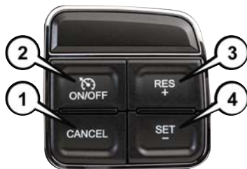
Speed Control Switches

The Speed Control buttons are located on the right side of the steering wheel.