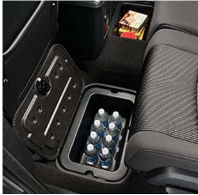
In Floor Storage

An in-floor storage bin is located behind each front seat.