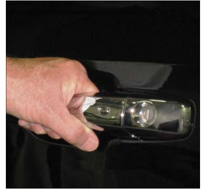
Grab The Door Handle To Unlock

With a valid Keyless Enter-N-Go key fob located outside the vehicle and within 5 ft (1.5 m) of the driver or passenger side door handle, grab either front door handle to unlock the door automatically.