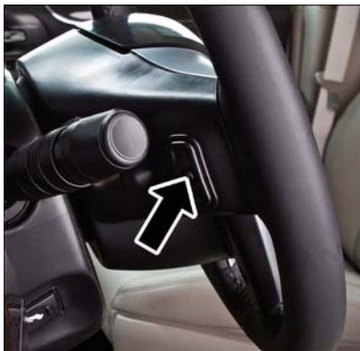
Steering Wheel Audio Controls

The steering wheel audio controls are located on the rear surface of the steering wheel.