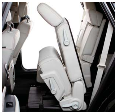
Seat In Tip 'n Slide Position