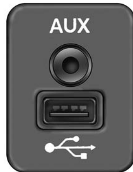
Uconnect Media Hub

This feature allows an iPod or external USB device to be plugged into the USB port. The USB port supports certain iPod and iPhone devices. The USB port also supports playing music from external USB devices. Some iPod software versions may not fully support the USB port features. Please visit Apple's website for iPod software up-