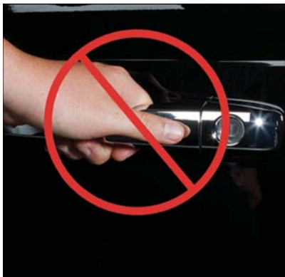
Do NOT Grab The Handle When Locking