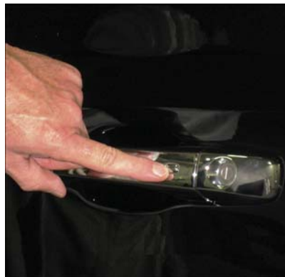
Push The Door Handle Button To Lock