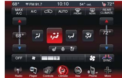
Radio 8.4 Automatic Climate Controls