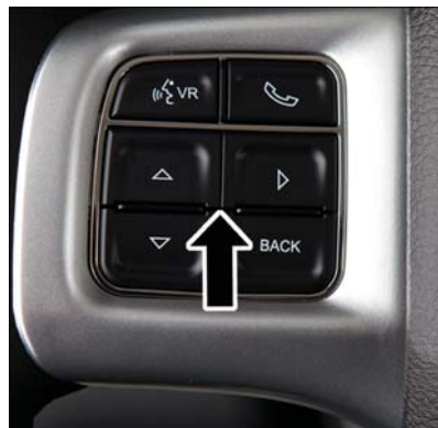
Instrument Cluster Display Controls

The instrument cluster display features a driver interactive display that is located in the instrument cluster. Pushing the controls on the left side of the steering wheel allows the driver to select vehicle information and Personal Settings.