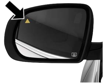
BSM Warning Light

The BSM warning light, located in the outside mirrors, will illuminate if a vehicle moves into a blind spot zone.