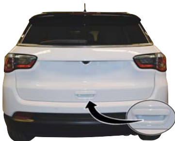
Liftgate Handle Location

To open the liftgate, squeeze the electronic liftgate release and pull the liftgate open with one fluid motion.