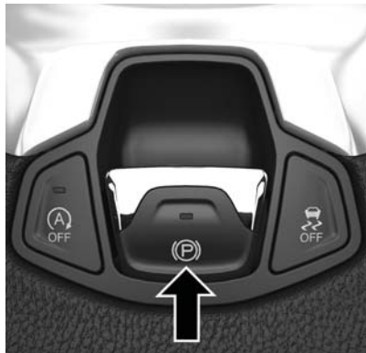
Parking Brake Switch

Your vehicle is equipped with a new Electric Park Brake System (EPB) that offers greater convenience. The park brake switch is located in the center console.