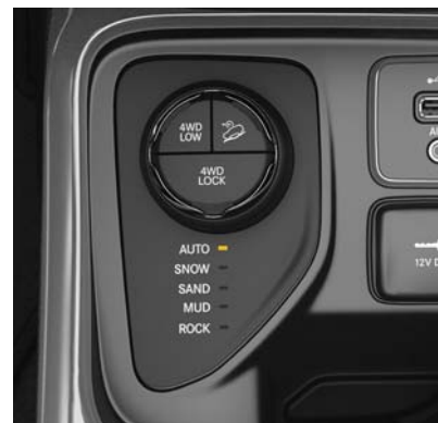
Selec-Terrain Switch (Trailhawk)