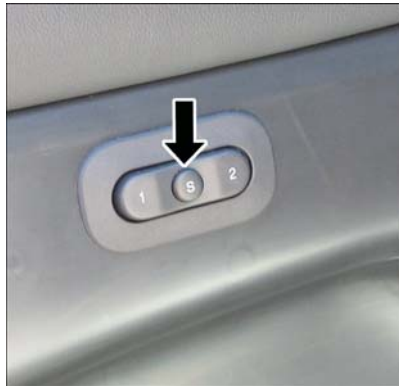
Memory Seat Buttons

The memory seat feature allows you to set two different driver's seating positions (excluding lumbar position), outside mirrors, radio station preset settings and tilt/telescoping steering column positions (if equipped). The memory seat buttons are located on the driver's door panel.