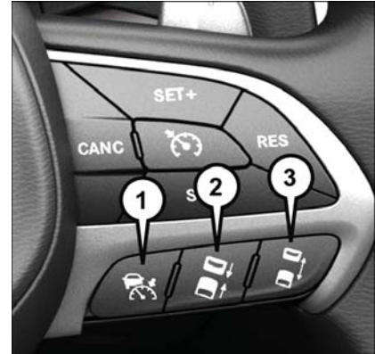
Adaptive Cruise Switches

Your vehicle will not exceed the cruise speed you have set. • If the sensor does not detect a vehicle directly ahead of you, it functions like a standard cruise control system, maintaining the speed you set.