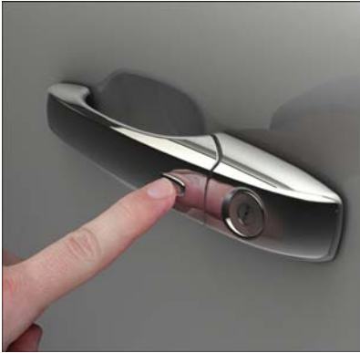
Push The Door Handle Button To Lock