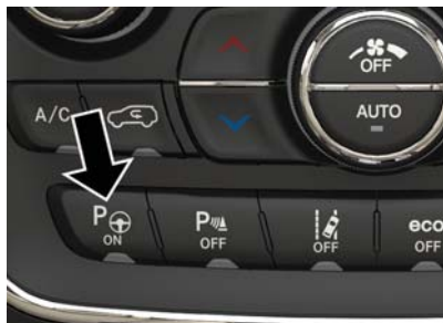
ParkSense Active Park Assist Switch Location

The ParkSense Active Park Assist system can be enabled and disabled with the ParkSense Active Park Assist switch, located on the switch panel below the Uconnect display.