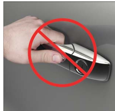
Do NOT Grab Handle When Locking