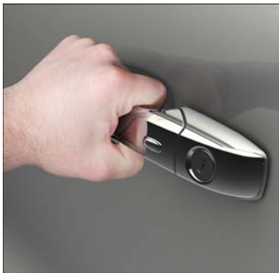
Grab The Door Handle To Unlock

With a valid Keyless Enter-N-Go Key Fob located outside the vehicle and within 5 ft (1.5 m) of the driver or passenger side door handle, grab either front door handle to unlock the door automatically.