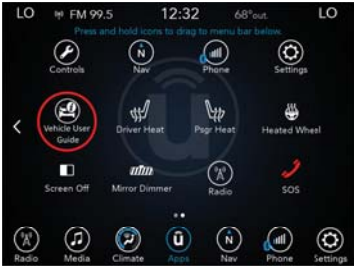
Vehicle User Guide Touchscreen Icon

To access the Vehicle User Guide on your Uconnect Touchscreen: Push the Uconnect Apps button, then push the Vehicle User Guide icon on your touchscreen. No Uconnect registration is required.