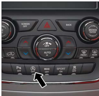
STOP/START Off Switch

The system will stop the engine automatically during a vehicle stop if the required conditions are met.