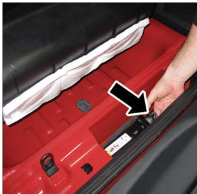
Jack And Lug Wrench Location

The jack and lug wrench are located in the rear storage compartment.