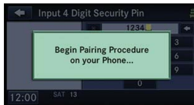
Mobile Phone Pairing