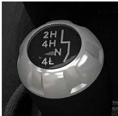
Four-Wheel Drive Shift Pattern

When operating your vehicle in 4L, the engine speed will be approximately three times (four times for Rubicon models) that of the 2H or 4H positions at a given road speed. Take care not to overspeed the engine.