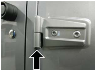
Hinge Pin Screw

The hinge pin screws and nuts can be stowed in the rear cargo tray located under the rear loadfloor.