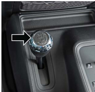
Four-Wheel Drive Gear Selector

additional traction and maximum pulling power for loose, slippery road surfaces only. Do not exceed 25 mph (40 km/h).