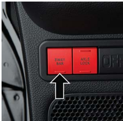
SWAY BAR Switch

This system is controlled by the SWAY BAR switch located on the instrument panel (to the left of the steering column).