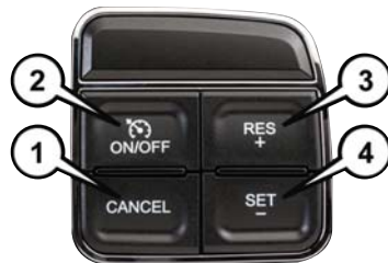
Speed Control Buttons

When engaged, the Speed Control takes over accelerator operations at speeds greater than 25 mph (40 km/h).