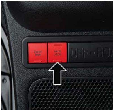
AXLE LOCK Switch

The AXLE LOCK switch is located on the instrument panel (to the left of the steering column).