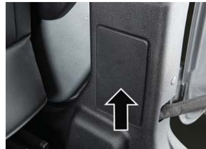
Trim Access Door